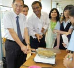
"Next order coming up!"